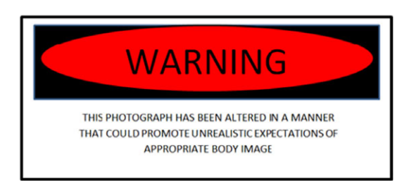
FIGURE 1 Warning label displayed on fashion images in the warning label condition [Color figure can be viewed at wileyonlinelibrary.com]

A series of ten fashion advertisements featuring women (the same ads were used for both conditions) was displayed on a computer screen and immediately after viewing each ad, they completed measures assessing their attitudes and affective response toward the advertisements. After viewing all ten images, a research assistant told participants: